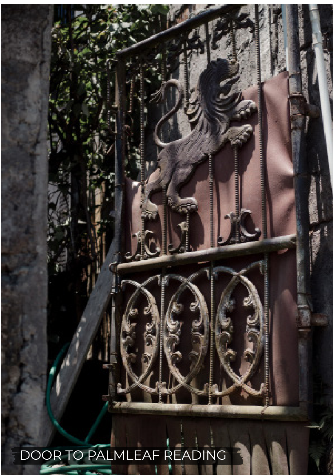
DOOR TO PALMLEAF READING