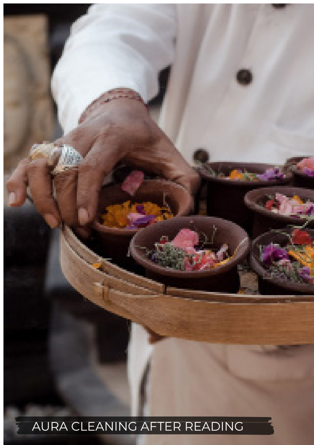
AURA CLEANING AFTER READING