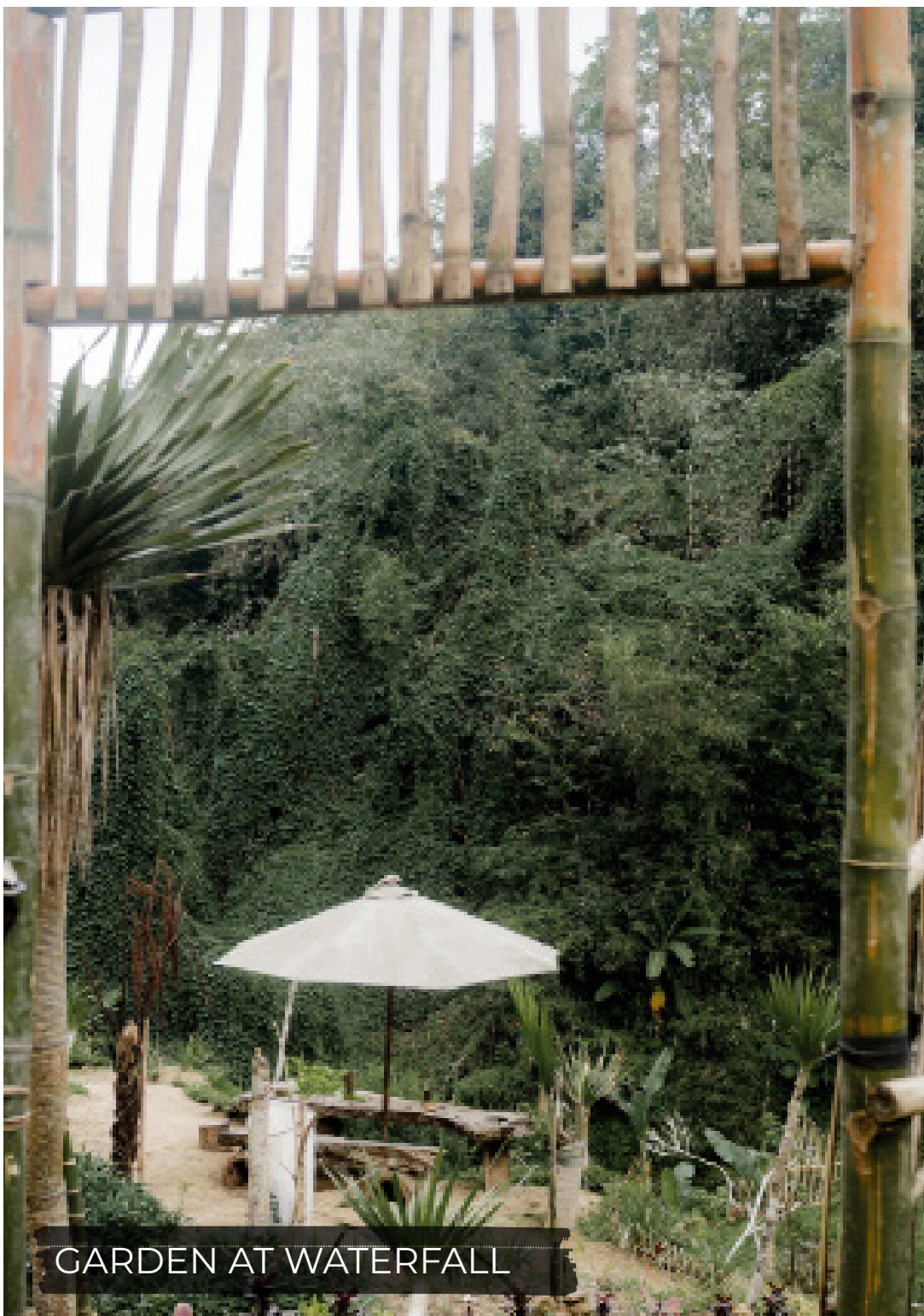
GARDEN AT WATERFALL