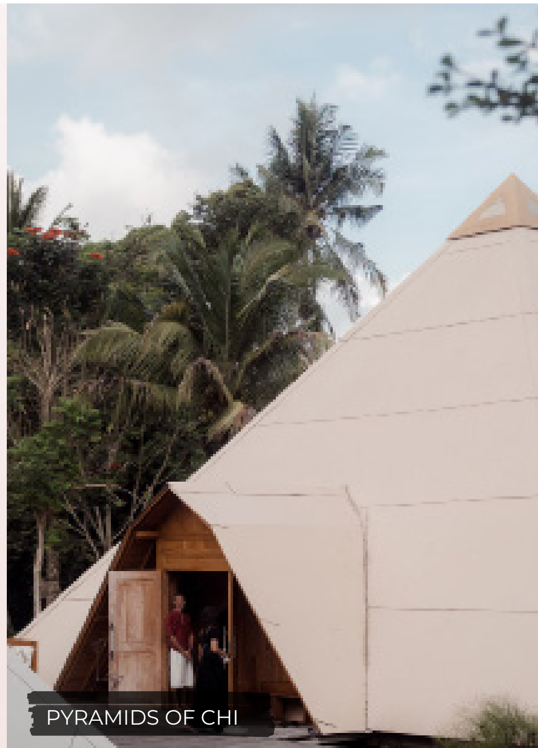
PYRAMIDS OF CHI

Lay down right behind one of the big gongs