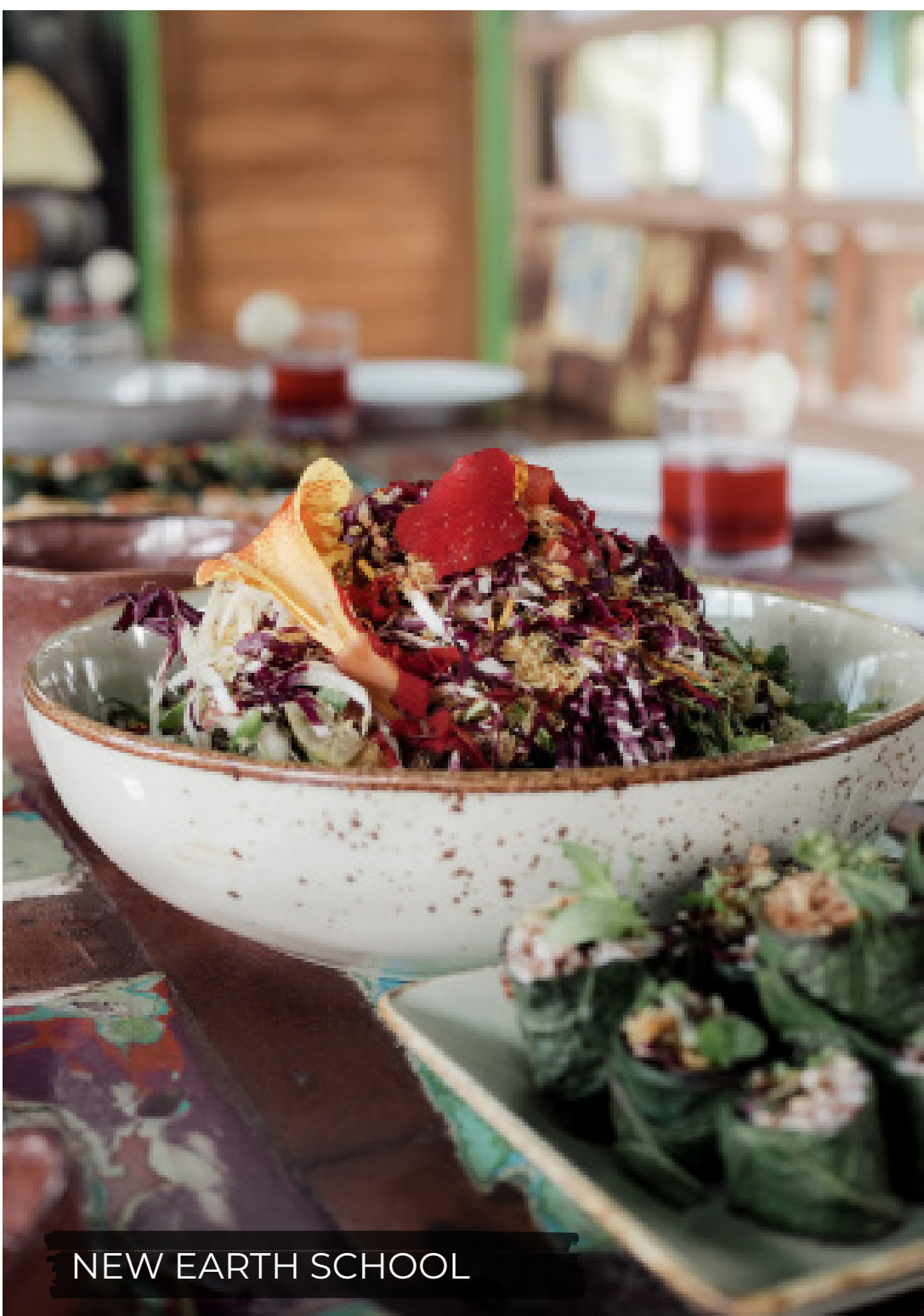
NEW EARTH SCHOOL