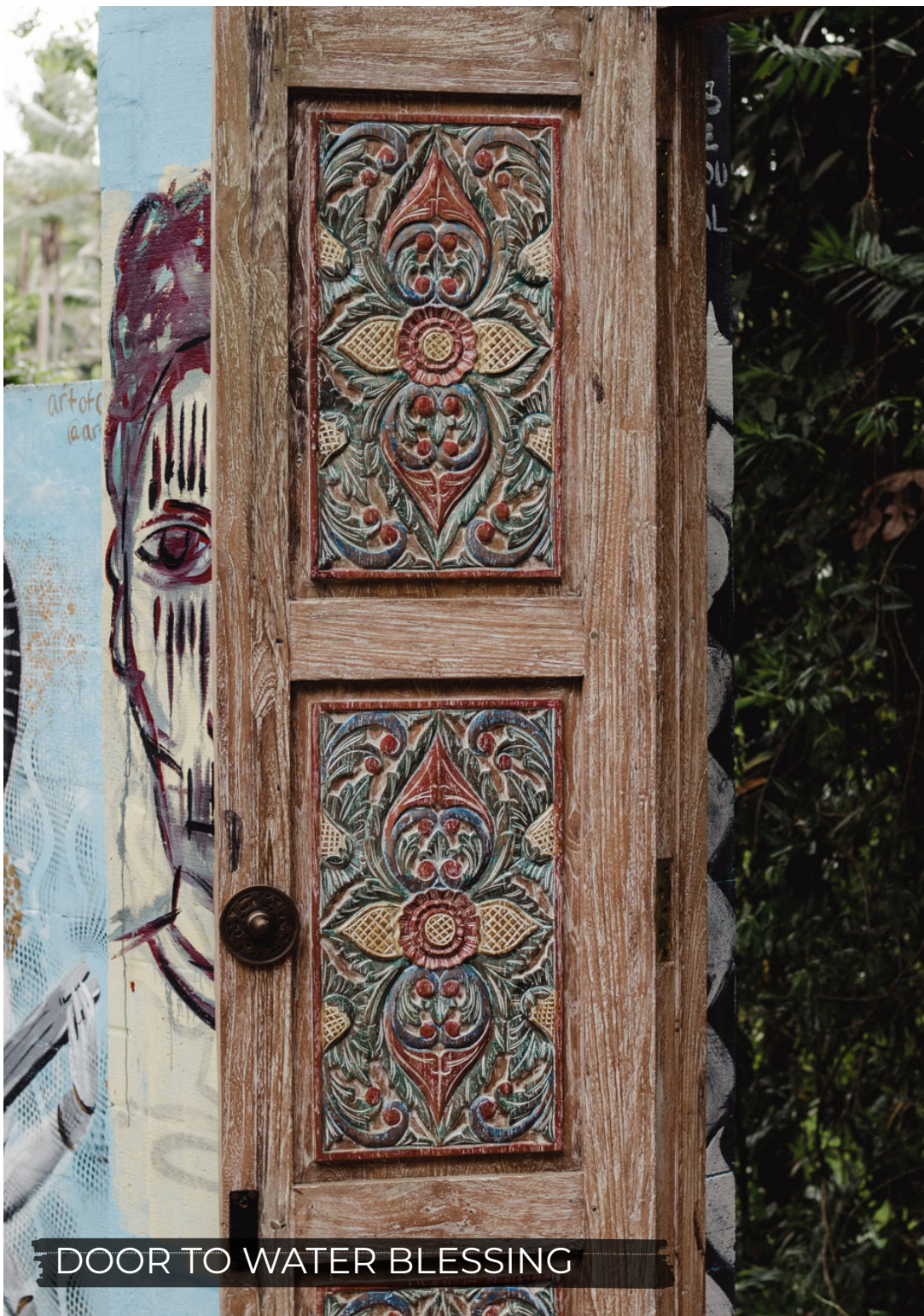
DOOR TO WATER BLESSING