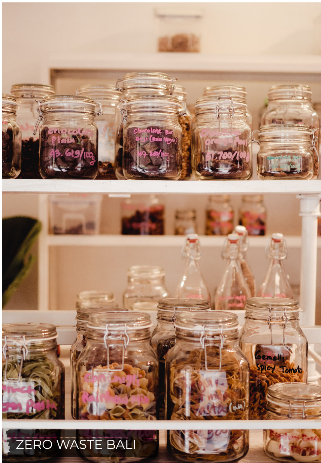
ZERO WASTE BALI