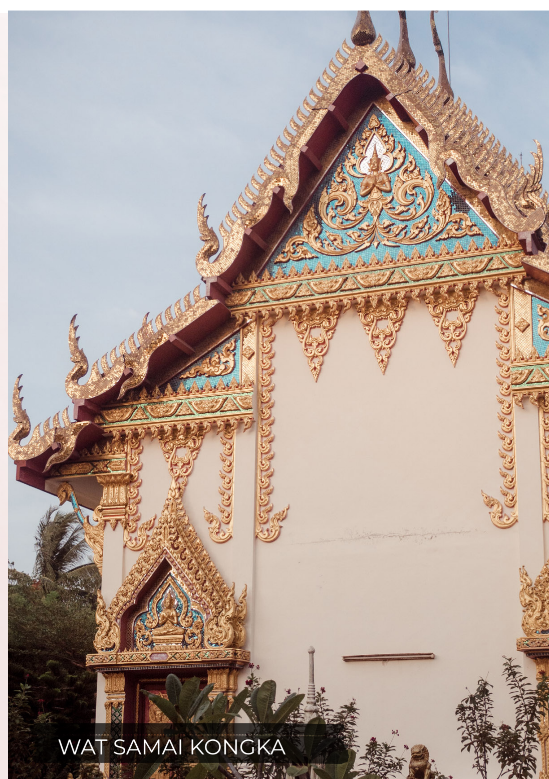
WAT SAMAI KONGKA