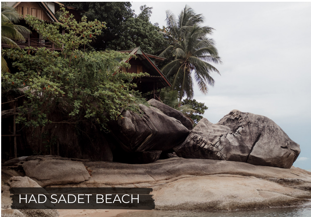
HAD SADET BEACH