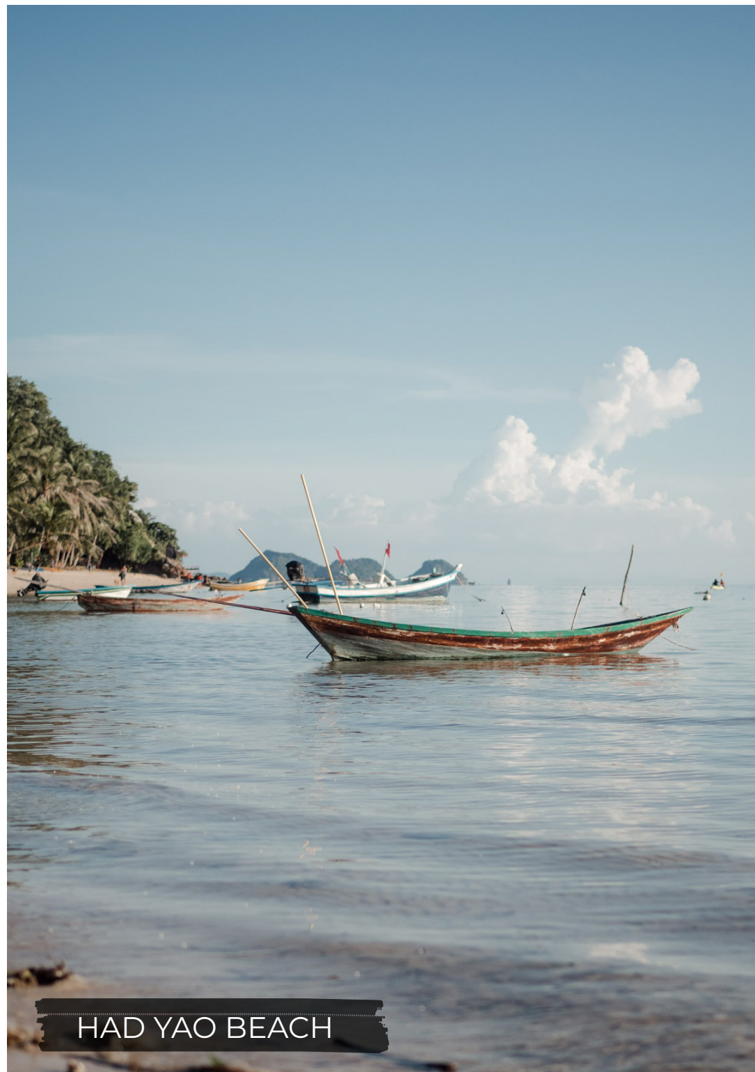
HAD YAO BEACH